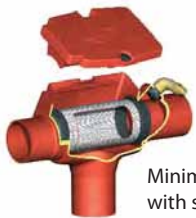
Minimax-Filter® internal with straight outlet